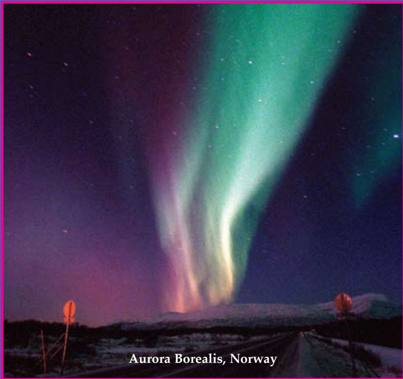
Aurora Borealis, Norway

"Promoting a Lifestyle Free of Alcohol and other Drugs"